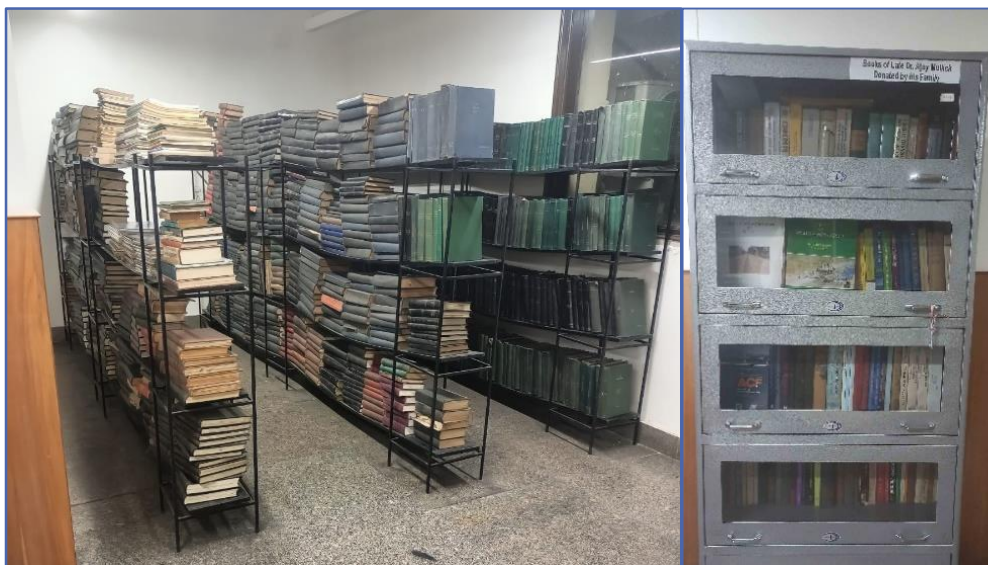
Fig. 2. View of the books in Library