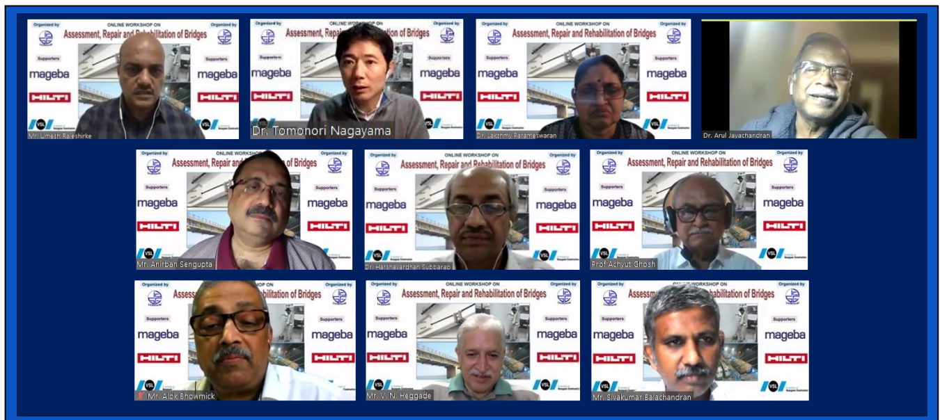
Fig. 2. Glimpses from the Online Workshop